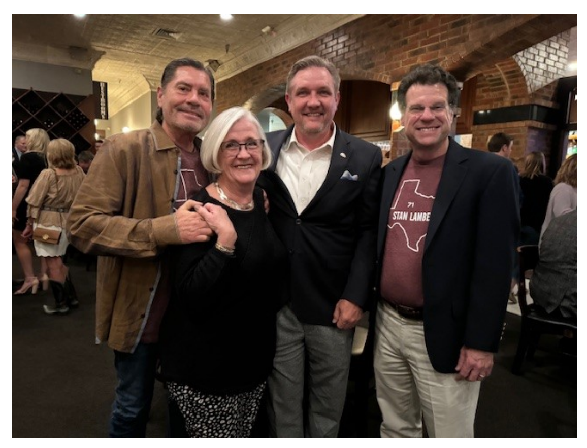
Stan Lambert Watch Party